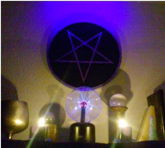
6" globe on the altar with a black light above.