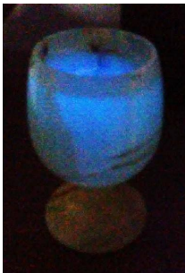
Tonic water in a translucent stone goblet.