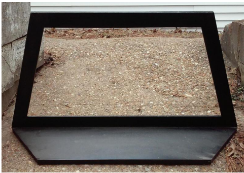
Trapezoid themed altar (work-in-progress).