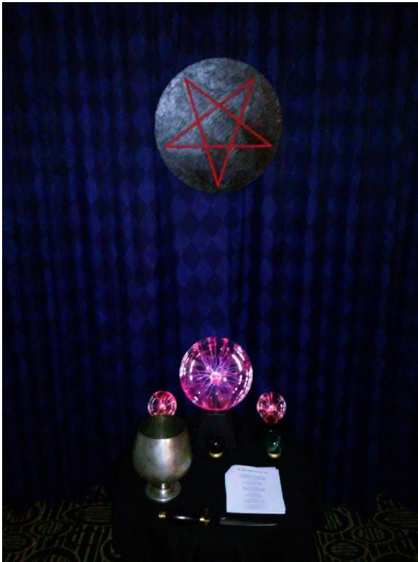
Hotel ritual, 8" plasma globe and others.