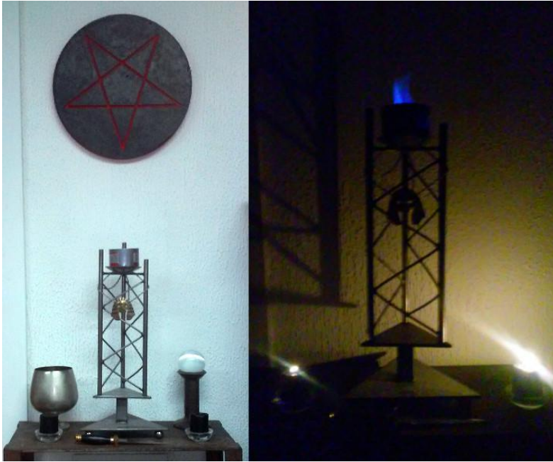
Fire altar with a broad Sterno flame.