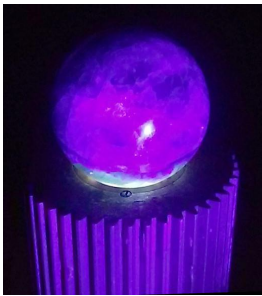
Fluorite stone atop an industrial steel gear.