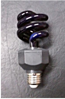
UV screw bulb.