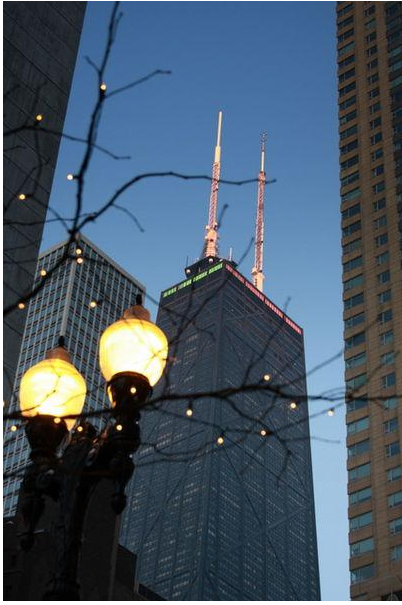
John Hancock Tower.